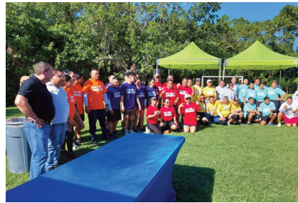
Celebration with the Food and Beverage department.