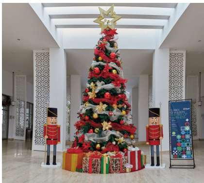
Start of the annual campaign to collect toys and school supplies for donation in January 2025.