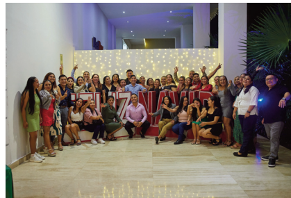
Hotel Christmas celebration with the employees.