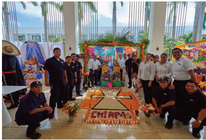
The traditional display of altars and 'Catrinas' was held, with the aim of preserving our traditions.